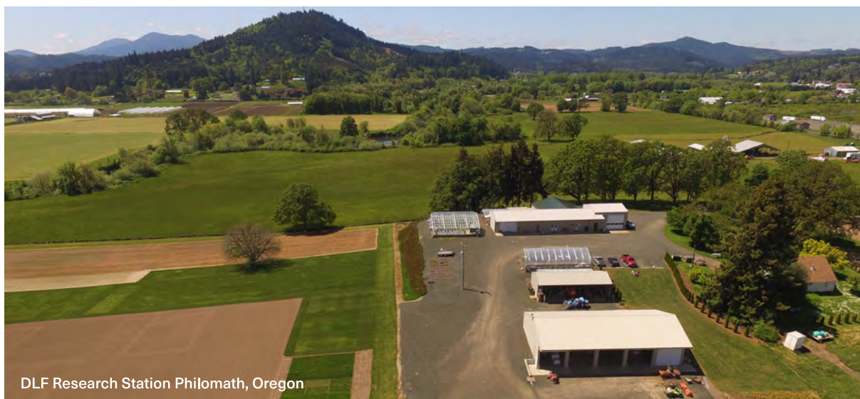
DLF Research Station Philomath, Oregon

ods have dramatically improved and resources DLF has allocated to this effort increased substantially. The original simple selection methods were complemented with pair crossings, creation of tetraploids, molecular marker-assisted breeding and inclusion of novel endophytes. Genome Wide Selection is the latest tool in our variety improvement program. R&D remains a crucial part of operations at 10% of the total DLF workforce.