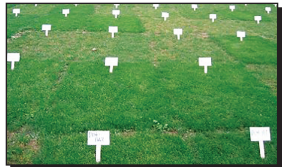
Turfgrass trials photo with and without Gray Leaf Spot.